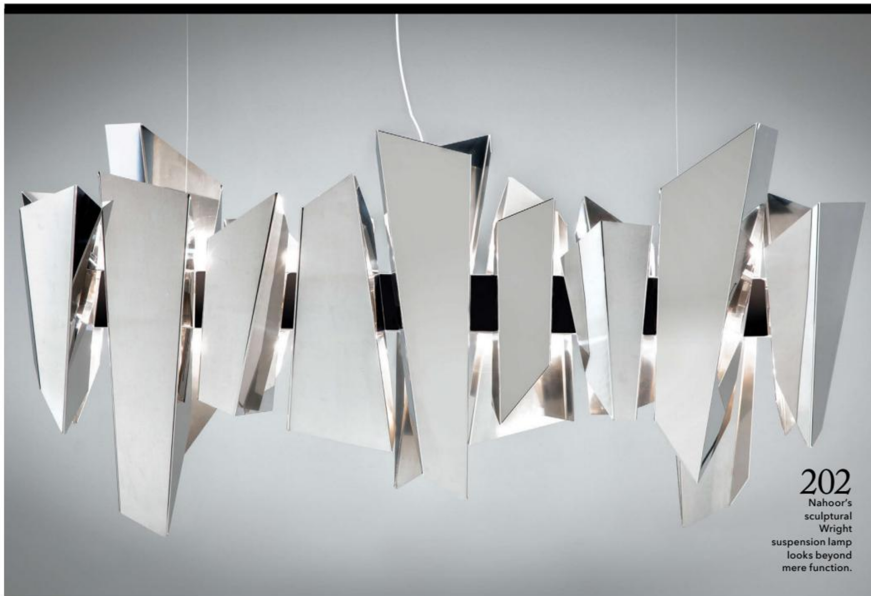
202 Nahoor's sculptural Wright suspension lamp looks beyond mere function.